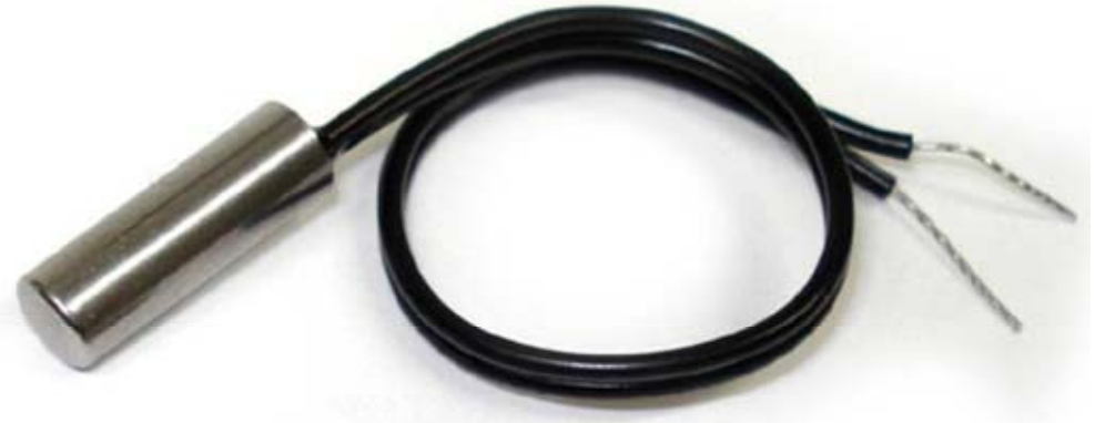
Temperature Sensor: 0.6" stainless steel probe temp sensor, 10Kthermistor, standard Curve 3