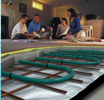
Radiantmax Floor Heating