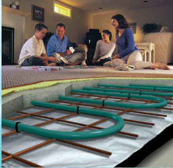
Radiant Floor Heating